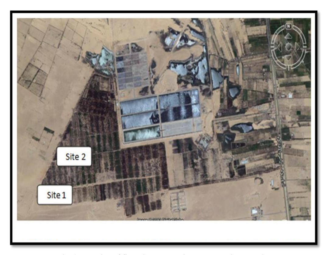
Fig. 1. Location of Serapium plantation and experimental sites

Azadirachta indica form factor is: 0.38( Nanang et al., 1997).