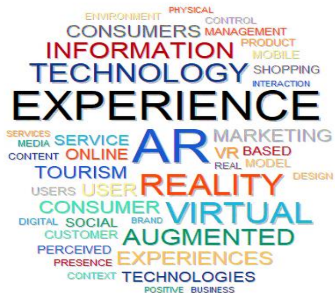
Figure 1 Visual Representation of Words Frequencies Using Cloud Graph

Consequently, start analysing the data in order to extract meaningful information that uncover the hidden thematic structure of the text. Then, creating a categorization dictionary to group words or phrases, and exclude low frequency items prior to using topic modelling procedure (See Table 3). To differentiate documents and extract more precise results about the various topics they contain, an analysis at the documents level is conducted to segment the dominant issues contained across the 42 cases. The emergent themes were categorized into 6 broad topics as illustrated in Table 3.