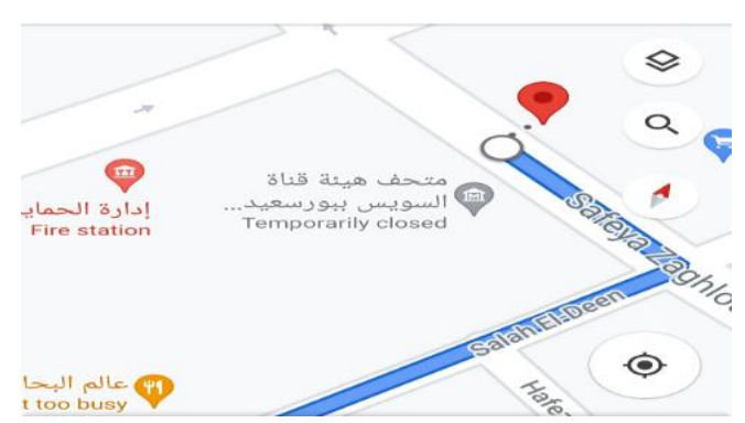
Fig.6. The location of the Museum of the Suez Canal Authority on google maps.

The building is surrounded by the fire fighters' office (civil defense) on the northwestern side, the old fish marketplace on the southeastern side and an abandoned building on the southwestern side (Fig. 6).