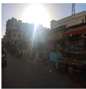
Fig.10. The rampant local encroachment of the old fish market shops on the museum's southeastern enclosure wall.