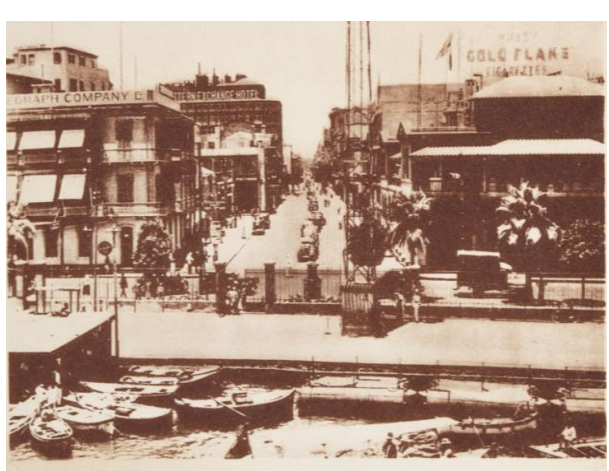
Fig.4. Empress Eugénie 's Street at Port-Said. (https://hdl.handle.net/1911/5734)

(Mayorkino, 1900). Despite the fact that Eugénie street's name has been officially changed to Safīya Zaġlūl , as after the 1952 coup, the majority of