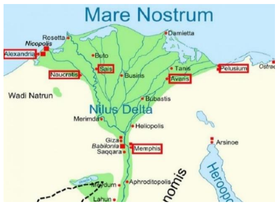
Fig.2. The Location of Pelusium. (https://ar.maps-egypt.com/).

The site of today's Port Said was originally a small coastal village of fishermen known in the ancient Egyptian hieroglyphs as (Pr- \dot{l}mn ) or (S3'inu), which means the city of Amun or the house of Amun, situated at the northeastern side of Tanis (Gauthier, 1928). It was known by the Ancient Greek as Pelusuim ( \Pi\eta\lambda o\dot{v}\sigma iov or \Sigma a\dot{i}v ), which means muddy due to its location near to the Pelusiac branch of the Nile River (Donne, 1857).