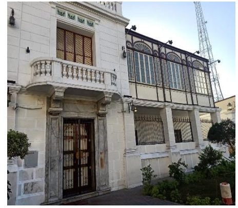
Fig.7. The entrance of the museum.

The Museum of Suez Canal Authority, known as the Villa of Eugénie, occupies an area of 1292 m<sup>2</sup>. The building is considered a unique architectural masterpiece with the European style as it was built on stone foundations and supported solely with stone walls instead of reinforced concrete. It is bordered by three gardens on three sides: the northwestern, southwestern and The southeastern. entire including the three building, gardens, surrounded by a stone enclosure wall supported with iron bars. On the southern corner of the