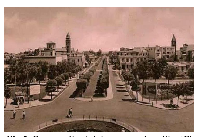
Fig.5. Empress Eugénie's street at Ismailia. (El-Gendy, 2015).

The festivities continued on the 17th and 18th of November when Eugénie arrived at Ismailia on her yacht L'Aigle (The Nautical Magazine, 1869). The street which witnessed the procession Khedive Ismail with Empress Eugénie during the celebration of the Suez Canal opening was named after her as "Eugénie's street" as well (Fig. 5). This street connects between the ancient Ismailia station to the port of Ismailia and is currently known as {}^{c}Ur\bar{a}b\bar{\iota} street (El-Gendy, 2015).