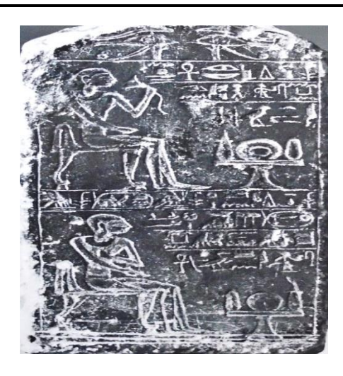
Fig. (3): A limestone stela of two prospectors dating back to the reign of King Montuhotep (Neb-hebt-re) ( after Waser, G.H., Zurich, A.G., 1978, p.155)

In the above-mentioned stela, each of the two persons is referred to as smnty "prospector", which means that he was no more than a normal member of this gang. In addition, both prospectors are represented and described in the inscription as m3<sup>c</sup>-brw "justified or deceased". Therefore, the text undoubtedly dates back to the reign of Montuhotep (Neb-hebt-re). These two prospectors are deemed to serve in the late First Intermediate Period and the early Eleventh Dynasty until the reign of Montuhotep (Neb-hebt-re) himself when they passed away(Cassirer,M.1952,PP.42-43).