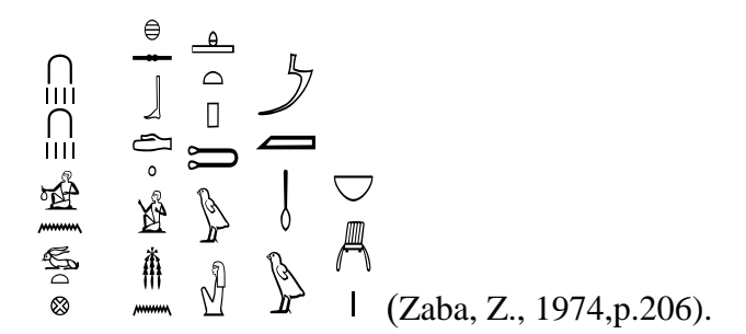
(h3t-sp) 28 smnty n Wnt [c] Hsbd msy n Htp-tw m3c-hrw nb im3h

The term smnt ( yw ) in the Middle Kingdom was recorded on the rock inscription no. 211, which was assigned to Khsbed who was a prospector of minerals and precious stones. The text reads