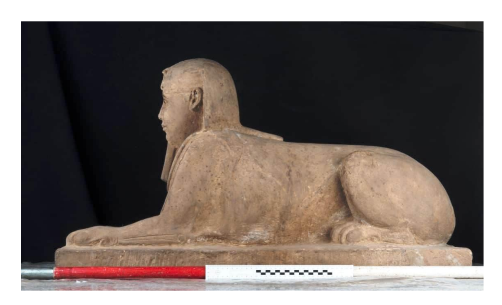
Figure 2: Left side