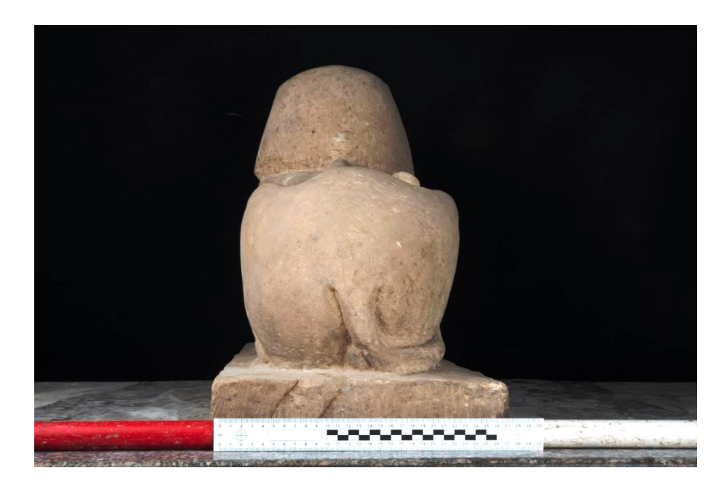
Figure 4: back view