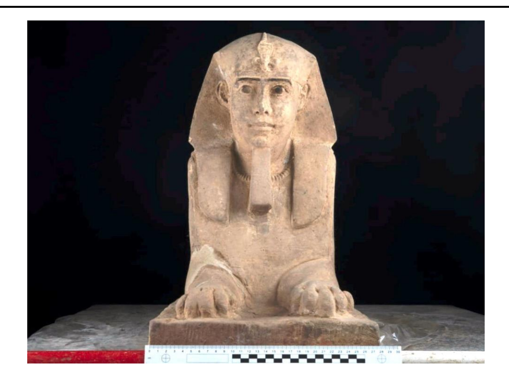
Figure 3: front view