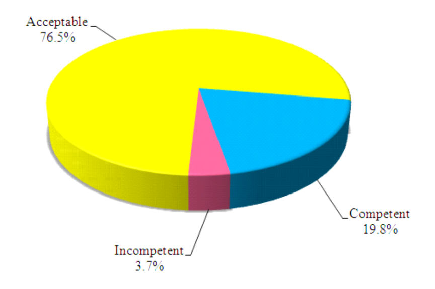
Figure (2): Nurses' overall practice regarding toxicological emergencies (n = 81)