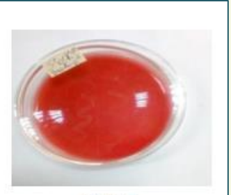
Figure 7 Red color appeared and spread overall the surface (7 days)