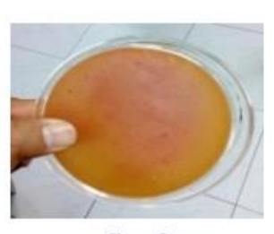
Figure 5 Red color zone appeared around inoculation line "Zigzag shape" of BacillusSubtilis (2 days)