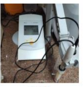
Figure 6 pH Reading