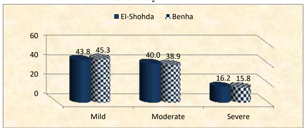
Figure (2): Distribution of studied mothers (ElShoda and Benha groups) regarding total score of depression scale (n= 225)

Table (1): Mean and standard deviation of coping strategies followed by mothers in El Shohda and Benha groups.