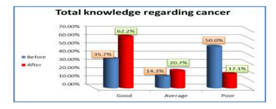
Figure (1): Percentage distribution of the studied caregivers' total level of knowledge regarding cancer before and after the educational guidelines implementation.