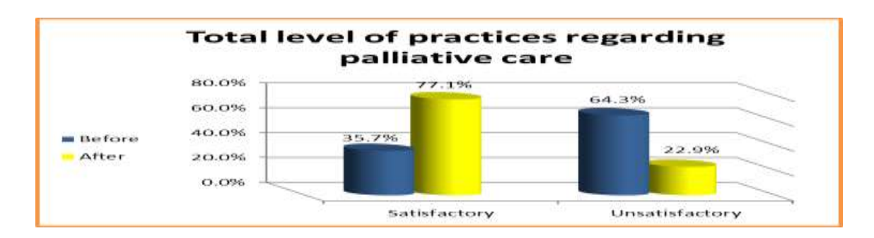
Figure (4): Percentage distribution of the studied caregivers' total level of practices regarding palliative care before and after the educational guidelines implementation.