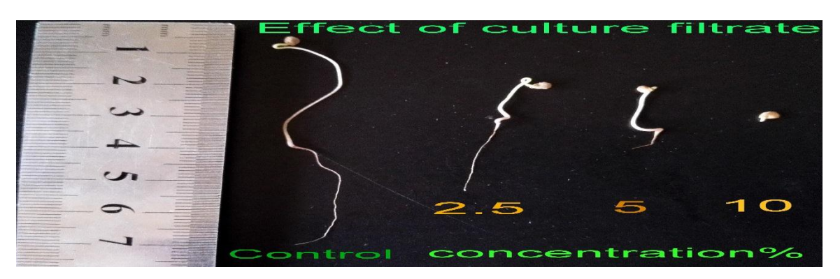
Fig. 11 Effect of some concentration of free culture filtrates of F. oxysporum f. sp lycopersici on tomato seed germination and other growth parameters.