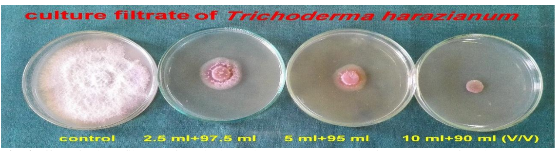
Fig. 4 Effect of culture filtrates of Trichoderma harzianum on growth of F. oxysporum f. sp lycopersici.