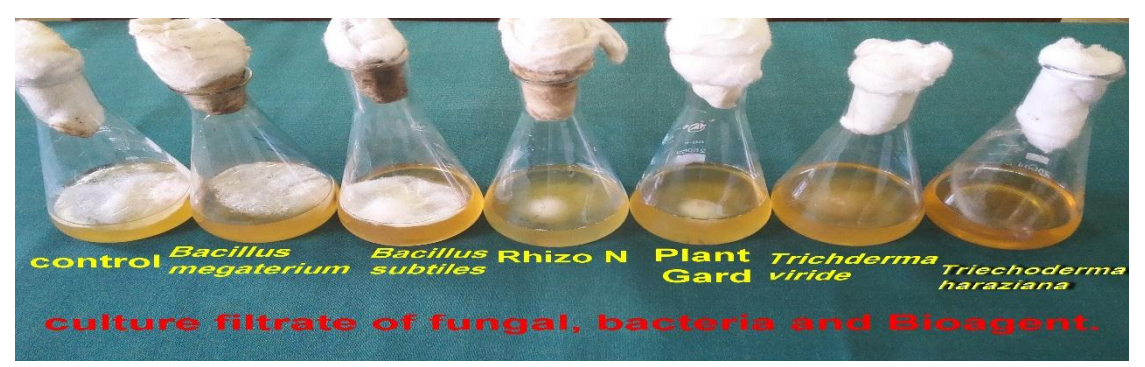
Fig. 10 Effect of culture filtrates of different bioagents on growth of F. oxysporum f. sp lycopersici . on liquid media.