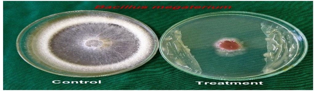
Fig. 2 Antagonistic effect of Bacillus megaterium against the virulent isolate of F. oxysporum f. sp lycopersici in vitro.