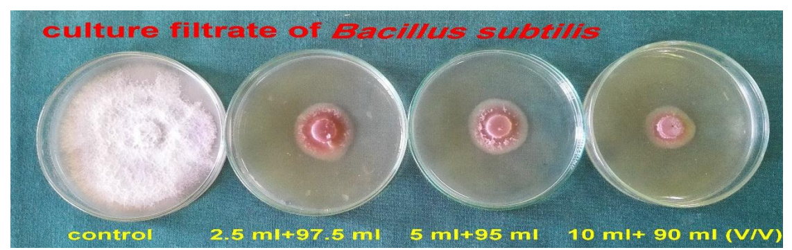
Fig. 7 Effect of culture filtrates of Bacillus megaterium on growth of F. oxysporum f.sp lycopersici.