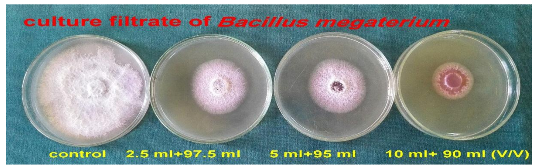
Fig. 8 Effect of culture filtrates of Bacillus subtilis on growth of F. oxysporum f.sp lycopersici.