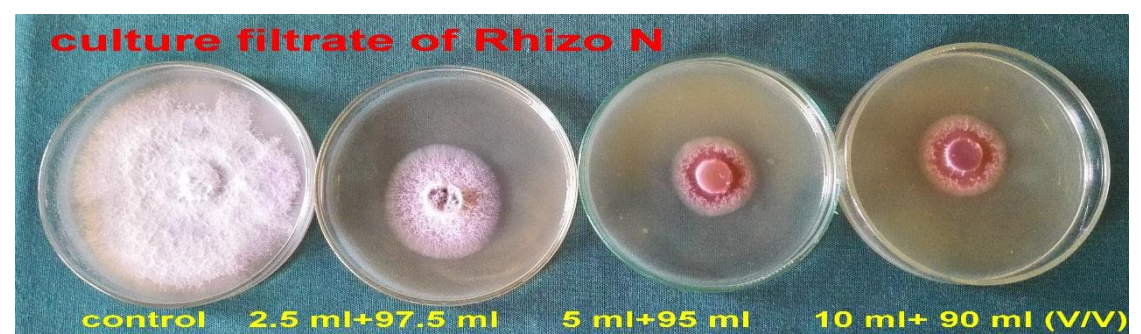
Fig. 9 Effect of culture filtrates of Rhizo-N on growth of F. oxysporum f. sp lycopersici.