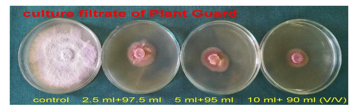
Fig. 6 Effect of culture filtrates of plant-Gard on growth of F. oxysporum f. sp lycopersici. (Most virulent isolate)