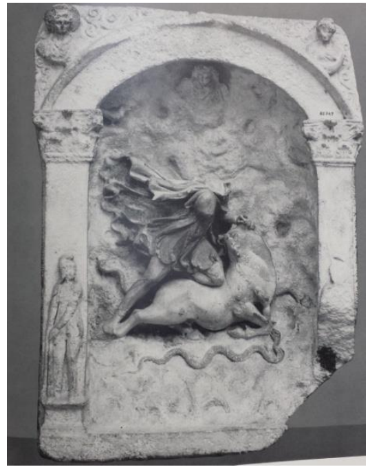
Fig.2. Marble relief of Mithra slaughtering a bull, Egyptina Museum, Cairo.

The second relief of Mithra is made of limestone and exists in the Egyptian Museum in Cairo (No. 7259). In this relief Mithra is represented slaughtering a small bull. In this relief the Mithra's head and right arm also have got lost. The dog is clearly seen running towards the wound, while the scorpion is not clearly visible in this relief. At the top corners, there are two representations of "Sol" with the nimbus on the left and "Luna" with the crescent on the right. It is suggested that this piece was plastered into a wall or even was an initial sketch as the border of the rock is painted red (Harris, 1996) (Fig.3)