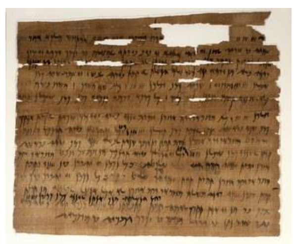
Fig. 1. Brooklyn Museum Papyri from Elphantine Island. After: Porten, B. 2011.

his wife, Tamet, who was an Egyptian slave. It is dating to 434 BC<sup>1</sup> (Porten, 2011) and contains the names of some Persian gods including Mithra which represents the existing of the cult of Mithra in this region (Mikolajczak, 2008) (Fig.1).