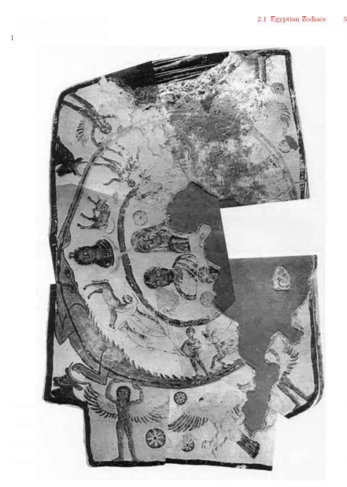
Fig.8. The Zodiac in the outer room of the Petosiris tomb. (After: Fomenko, el al, 2004, p.41).

Four discovered reliefs of slaying a bull (described above) were discovered in Memphis; three of them are displayed now in Egyptian Museum in Cairo, while the fourth one is displayed in Berlin Museum. Some researchers suggest that they were discovered in Hermopolis and mistakenly attributed to Memphis such as Cumont who states "the quality of sculpture represents that they came from Hermopolis" (Cumont, 1903; Martin, 2015).