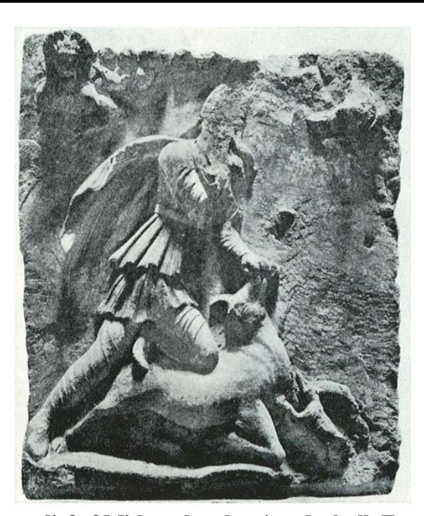
Fig.3. Limestone relief of Mithra slaughtering the bull, Egyptian Museum, Cairo. (After: Cumont,F. 1899).

The Third piece of Cairo Museum (No.7260) is a limestone relief representing Mithra wearing the Phrygian cap and slaying the bull. The relief is in a bad condition, but the dog and the scorpion can be seen, while the raven is no longer present (Harris, 1996) (Figs.4,5).