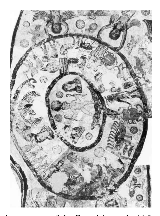
Fig.7. The Zodiac in the inner room of the Petosiris tomb. (After: Fomenko el al, 2004, p.40).

Two paintings represent two zodiacs were discovered on the ceilings of the inner and outer rooms of the tomb of Petosiris in the 20<sup>th</sup> century. The planets in these zodiacs are symbolised by bust portraits which is unusual in the Egyptian zodiacs. Some scholars connected these zodiacs to the cult of Mithra. They based on the symbolic meanings of the planets and consultations related to Mithra (Fomenko at el., 2004) (Figs.7,8).