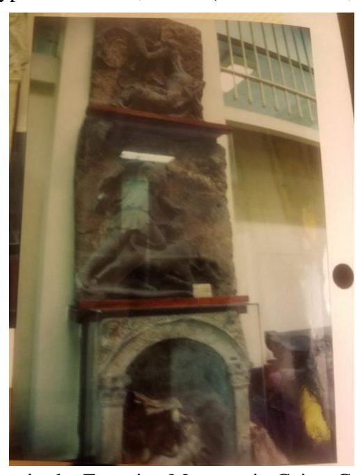
Fig.5. Pieces of Mithra in the Egyptian Museum in Cairo, Graeco-Roman section.