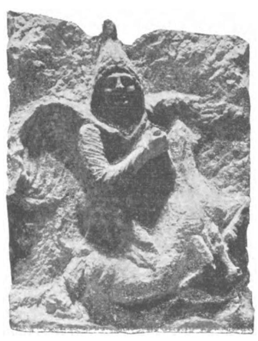
Fig.4. Limestone relief representing Mithra with the Phrygian cap and slaying the bull, Egyptian Museum, Cairo. (After: Cumont,F. 1899).