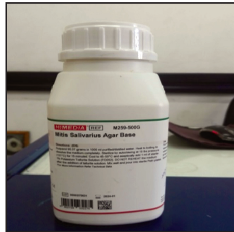
Figure (1) Mitis Salivarius Bacitracin Agar Base.

Case Selection: Ethical approval was obtained from the Research and Ethics committee of the Faculty of Dental Medicine of Al-Azhar University (Girl's branch), Cairo – Egypt, the study was explained to all the participants' guardians, and they signed informed consent denoting their agreement