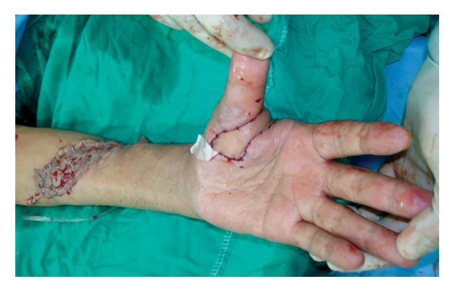
Fig. (6): Insetting of RRF flap volar view.