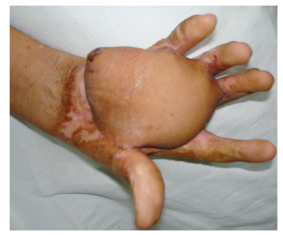
Fig. (10): Postoperative abdominal flap after separation.