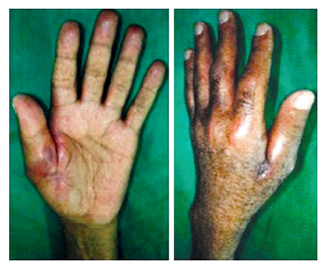
Fig. (4): Preoperative first web space contracture volar surface and dorsal view.