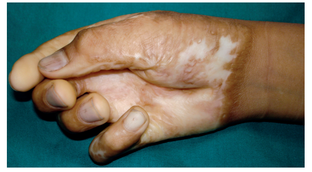
Fig. (7): Preoperative severe contracture post burn volar view.