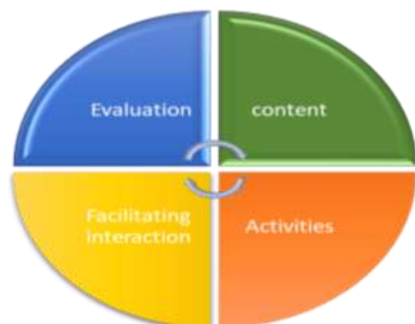
Fig (1): a pedagogical model for online teaching during covid-19 pandemic

Covid-19 forced schools and universities to transform from traditional learning to default one. At the same time, the Studyer used a pedagogical model (CAFE) to help teachers educate students with special needs during covid-19 pandemic online (Wang, 2020). The model consists of four stages: