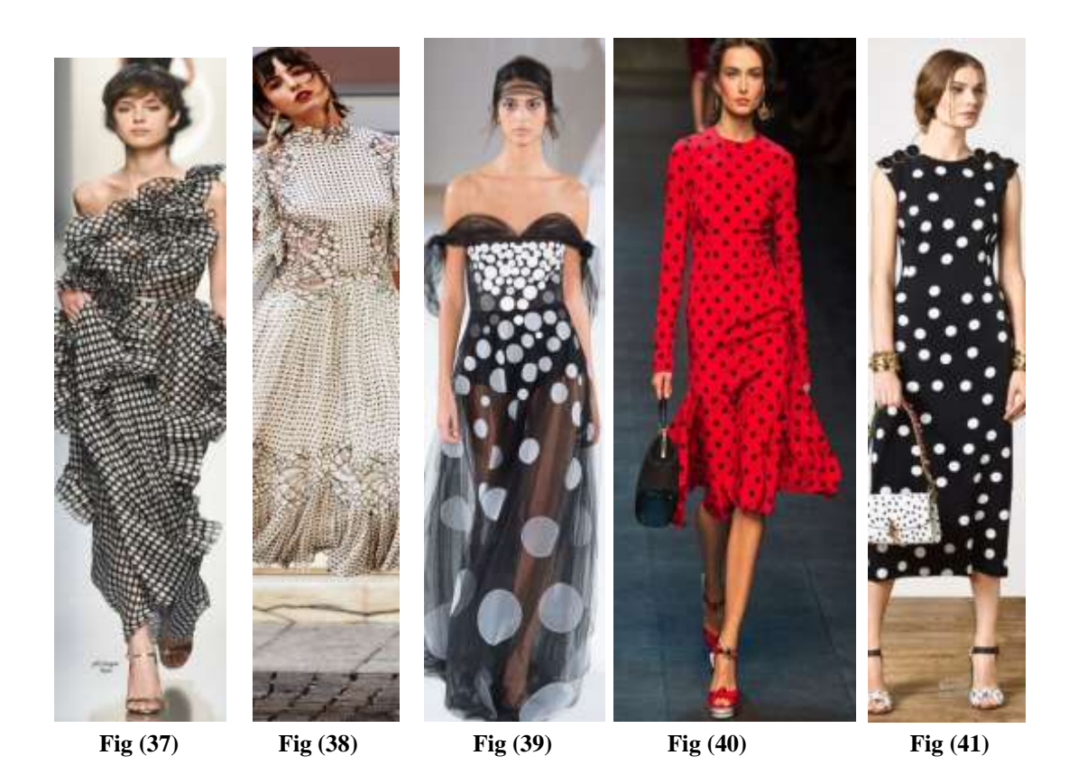
Mar 6, 2017 - Paris Fashion Week Trend: Polka Dots. Vogue's take on the polka dot trend at Balenciaga, Jacquemus, Loewe and Margiela at Paris Fashion Week. the fashion trends from Paris Fashion Week on Vogue.co.uk has been represented.