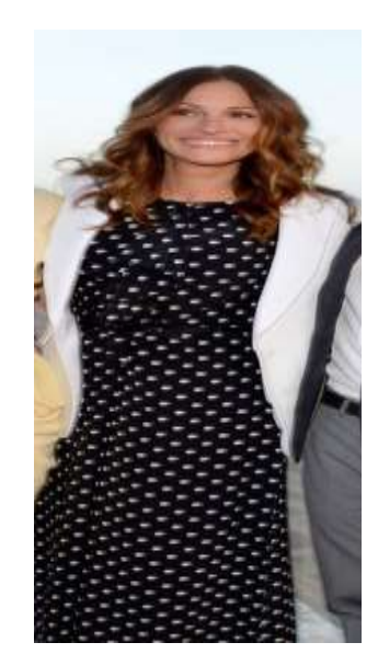
Julia Roberts fig (36)