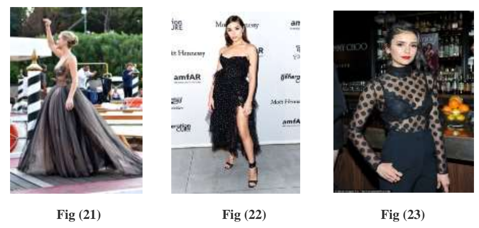
Fig (21) Jennifer Lawrence the Oscar-winning actress stepped in a sheer Polka Dot gown from Dior Couture's spring 2017 collection.

Layered over skin or fabric, sheer Polka Dots could minimise the imagination [11]. Monique Lhuillier's sheer shoulders give just a glimpse of skin, while Francesco Scognamiglio and Isa Arfen throw modesty out the window. Markus Lupfer's dress is perfect for a day at the office or a night drinking cocktails, while J. Crew imaginatively layers sheer Polka Dots over a white blouse for a lovely contrast. Fig(20) too. The outfit was by the fashion designer Elie Saab and we can certainly take some inspiration from it. What's not to love about the chic ensemble with statement Polka Dot print?