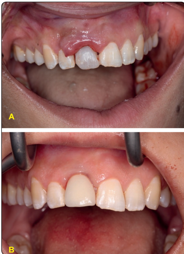
Fig. (2) : (a) Pink esthetic score immediate post-operatively and (b) at 6 months post-operatively

Mean stability immediately post-operative was 65.6 \pm 3.2 that increased to 73.7 \pm 2.4 six months postoperative. Mean increase from immediate to 6 months after was 8.1 representing 12.3% from the baseline. This difference was statistically significant ( p < 0.001 ) (figure 3)