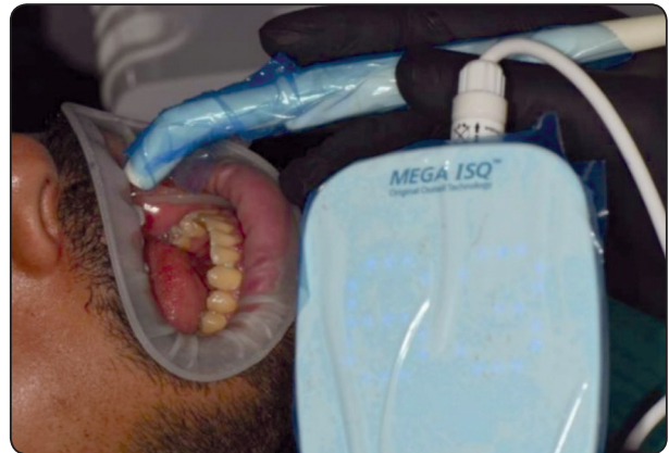
Fig. (3) implant stability quotation