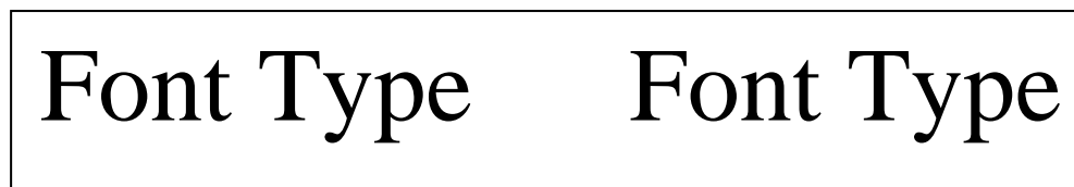
Fig 2: Font Type: Serif vs. Sans Serif

168 out of 233 children preferred the sans serif font type while 47 out of 233 children preferred serif font type. Figure 2 shows the different font type options discussed with children.