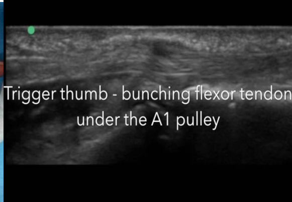
Fig. (2): Confirmation of trigger finger by MSUS (the figure from the present study).

Then, a blinded needle insertion was done by the expert physician from proximal to distal at the nodule site then ultrasound used to confirm the site of the needle if intra-sheath or extra-sheath and to guide the injection (figure 3,4).