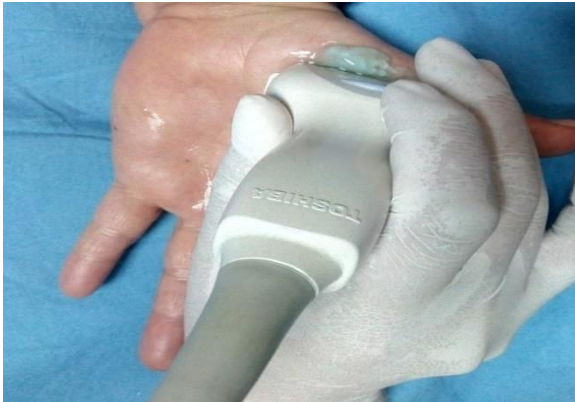
Fig. (1): Confirmation of trigger finger by MSUS (the figure from the present study).

pulley and assess its function clinically by examination of the patient through flexion and extension of the finger. The skin of the affected hand proximal to the transducer was prepared by 70% isopropyl alcohol. We are careful to maintain a sterile field around the edge of the transducer. Because we do not use a sterile transducer cover, the needle and puncture site are never allowed to contact the ultrasound transducer and using sterile gel (figure 1,2).