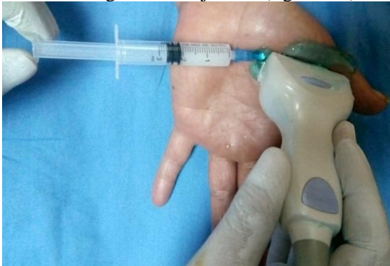
Fig. (3): Ultrasound used to confirm and to guide the site of the needle during injection (the figure from our study).

Then, a blinded needle insertion was done by the expert physician from proximal to distal at the nodule site then ultrasound used to confirm the site of the needle if intra-sheath or extra-sheath and to guide the injection (figure 3,4).