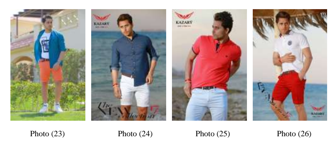
Italian beach style for Kazary catalogue