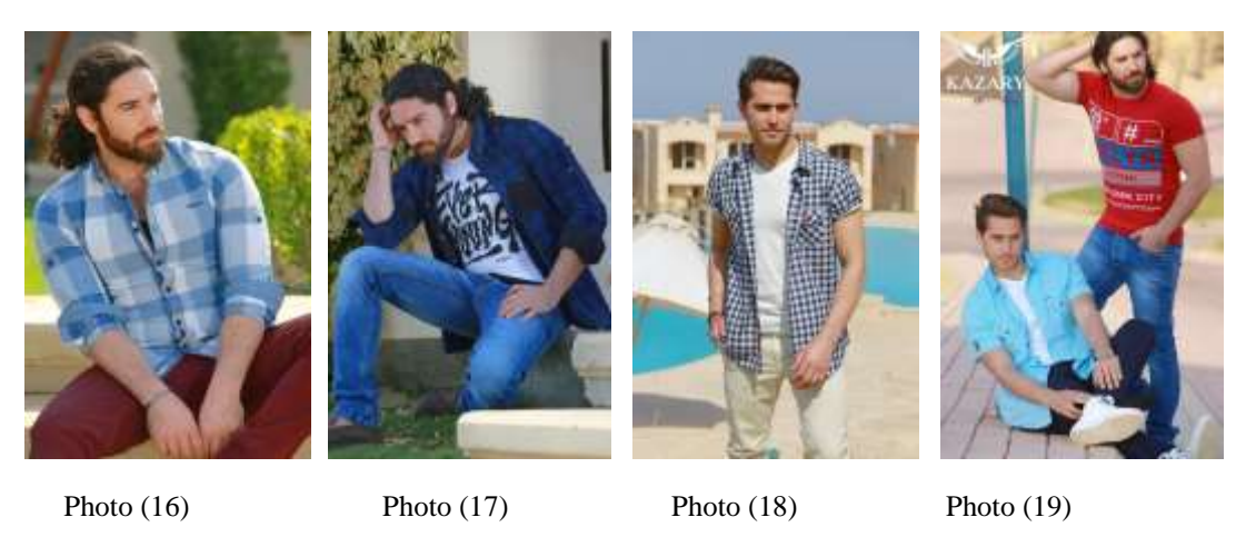
Casual style for Kazary catalogue