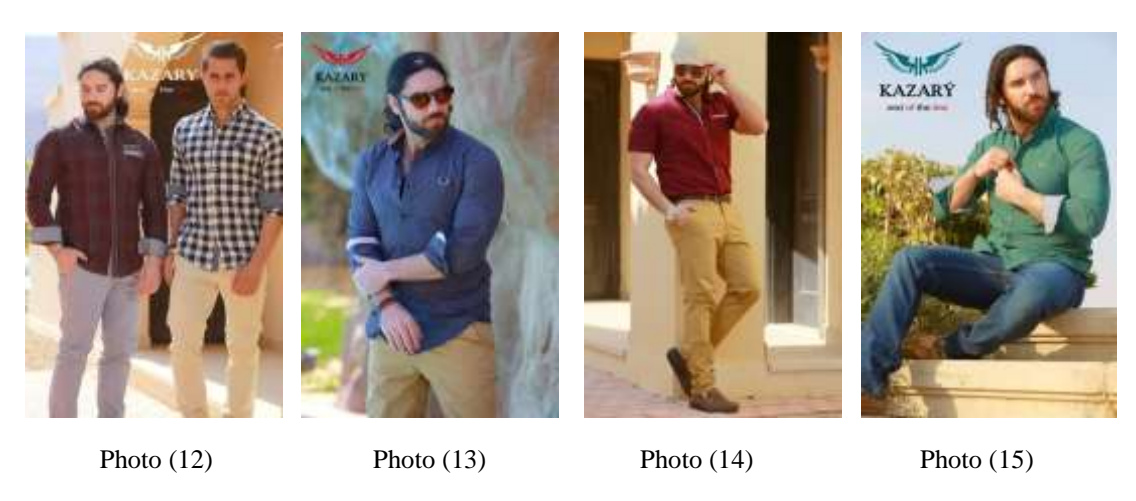
Chic-Casual style for Kazary catalogue