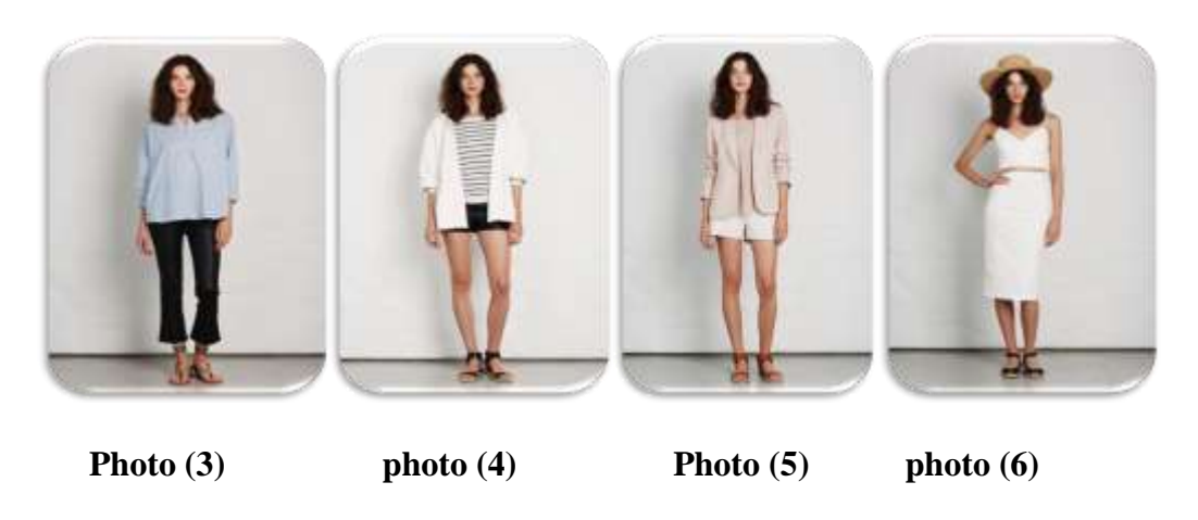
Joie Look book for 2012

A lookbook is a collection of photographs compiled to show off a model, a photographer, a style, or stylist or a clothing line. In fashion, a lookbook shows off a clothing line. A lookbook has generally been officially and only for individuals working in the fashion industry, mainly by a designer preparing for a runway show or for a photo shoot or to display collections for suppliers or big factories. So, it is not for customers. This book put a fashion look all together to help make sure the models had the right shoes with the right outfit and so on, so minimal care was taken in regard of the surrounding environment or visual image and all were basic. Only recently has the science of developing a lookbook improved. Lookbooks are used by designers to show their collection and also for big consumers to know what looks are trendy for each season. And it includes just the whole look photographed on a plain background mainly white or light grey as it shown in photos (3, 4, 5, 6)