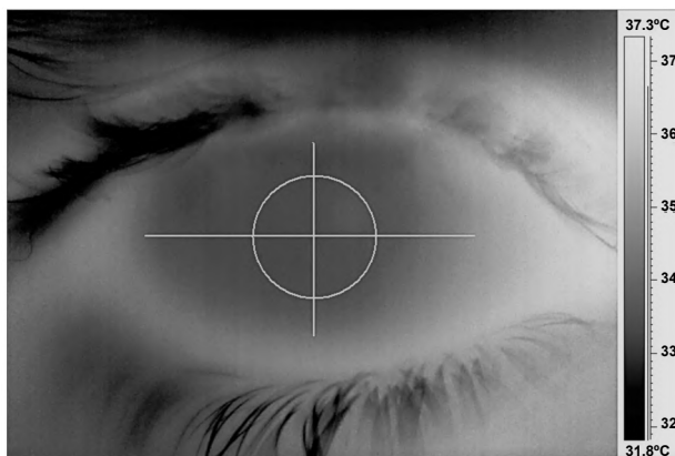
Fig. (1): Ocular thermogram displayed on PC screen with a circle of approximately 4mm represents the estimated geometric center of the cornea.