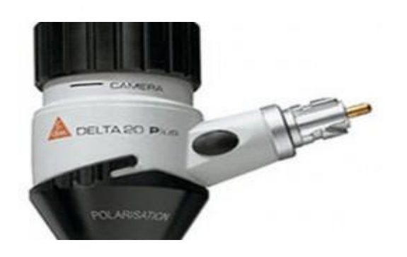
Fig (1): HEINE DELTA® 20 Plus dermoscope.