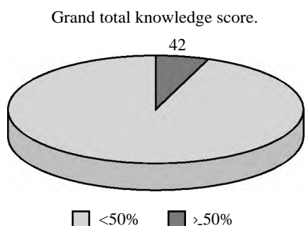
Fig. (2): Grand total knowledge score.

- Data expression [Test of significance]: Median (25th percentile - 75th percentile) [Kruskal-Wallis Test].