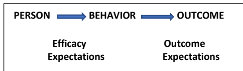
Figure (1): Bandura (2004) Self-Efficacy concepts