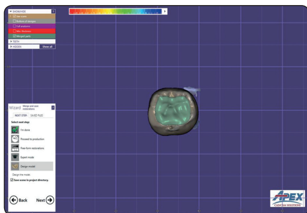
Fig. (1) The virtually designed restoration

Specimens were randomly divided into two equal groups according to the surface treatment applied to the fitting surface of the restoration before cementation; Group I: No treatment (CAD/CAM milled surface), Group II: Post-milling air abrasion at high pressure. In Group I, the inlays remained untreated, while in Group II, the fitting surface of the inlays were air abraded for 10 sec following the manufacturer's instructions with 50\ \mu\text{m}\ \text{Al}_2\text{O}_3 particles at a distance of 10 mm, at a 45^\circ angle to avoid any chipping in the restoration margins, but at 4 bar pressure. Air abrasion was carried out free hand to simulate the clinical situation, and by a single operator as shown in figure (2). The restorations were then cleaned and carefully dried with compressed air.