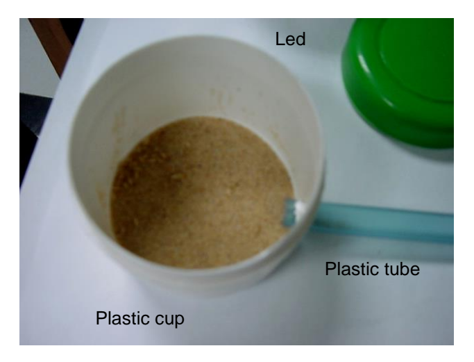
Fig. (1): Illustration of junction plastic cup and plastic tube.