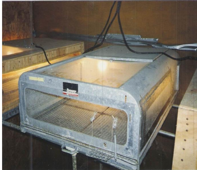
Fig (1): Brooder as described by McNitt and Moody, 1992