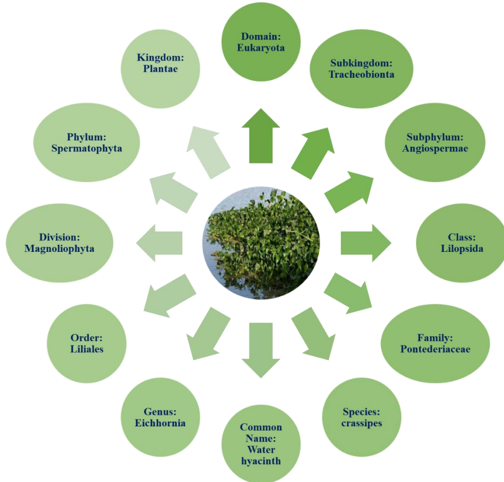
Figure 1: Classification of Water hyacinth

that carry diseases. Large water hyacinth infestations can obstruct transport through the rivers, hinder fishing and clog dams (Stohlgren et al. , 2013). Blockages in canals and rivers can lead to dangerous floods. Increased water hyacinth evapotranspiration, on the other hand, may have serious repercussions for places where there is still insufficient water. The depletion of biodiversity is also another problem associated with water hyacinth (Abhed, 2020).