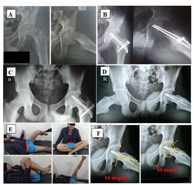
Figure (3) Male 16 ys, with lt-sided severe acute on top of chronic SCFE treated by modified Dunn procedure; (A) preoperative AP & frog lateral views (B) 3 month postoperative radiographs (C,D) 30 months-postoperative AP and frog lateral X-ray showing complete union of trochanteric osteotomy and physis with no evidence of AVN (E) Good postoperative ROM. (F) Post-operative Southwick and Alpha angles.