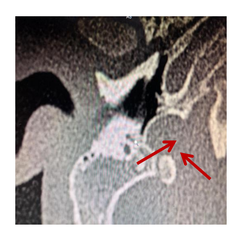
Figure 1 (A, B,C) (A),(B) sagittal CT sections and (C) axial section through temporal bones show bifurcation of mastoid segment of the facial nerve into medial and lateral segments. (red arrows).