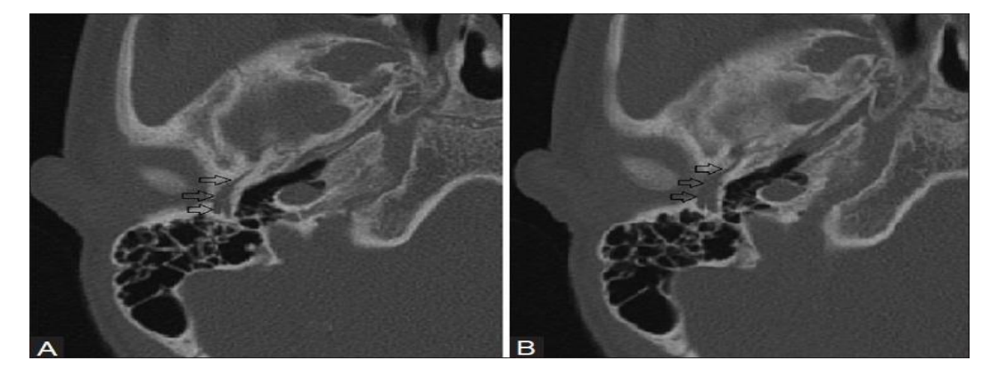
Figure 2 (A, B) (A and B) Serial axial CT sections of the temporal bone show bifurcation of mastoid segment of the facial nerve into medial and lateral segments; the lateral segment carries enlarged chorda tympani branch (open arrows) and the medial segment carries rest of the tympanic segment of the facial nerve.