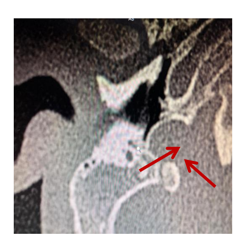
Figure 1 (A, B,C) (A),(B) sagittal CT sections and (C) axial section through temporal bones show bifurcation of mastoid segment of the facial nerve into medial and lateral segments. (red arrows).