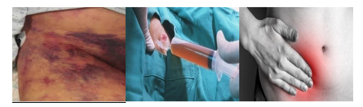
Fig. (4) Complication of laparoscopic TEP repair (hematoma, seroma and chronic groin pain)