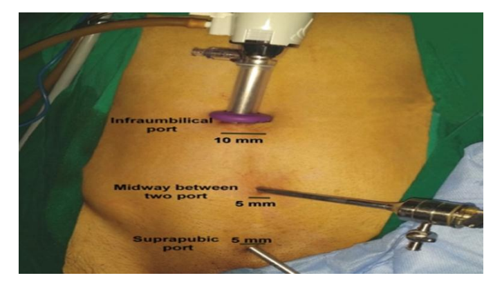
Fig. (1) Placement of trocars in laparoscopic TEP repair