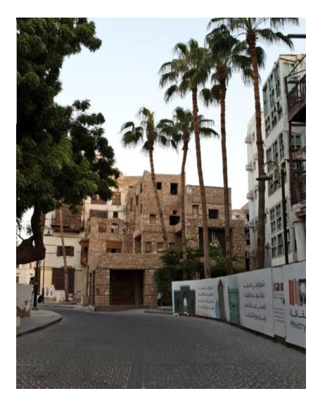
Figure 14,15, Maintenance of heritage buildings in Jeddah, tiling of streets and corridors and provision of lighting poles