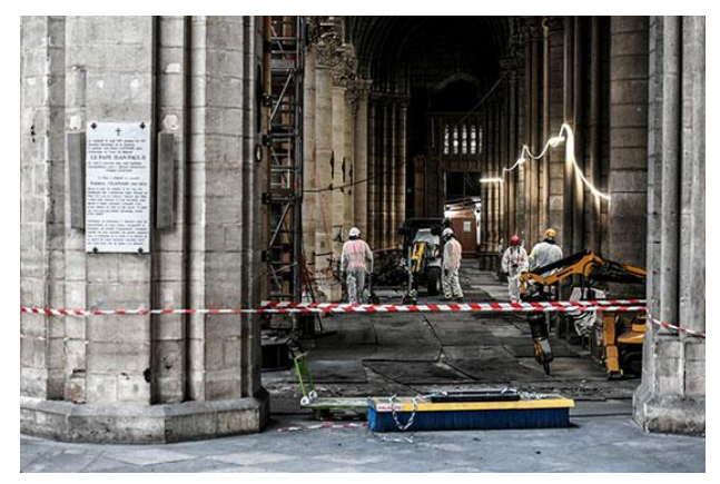
Figure 18, 19, Restoration work for important heritage buildings in the historic Rouen area