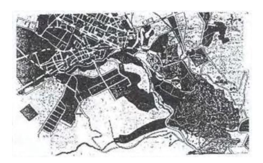
Figure 6, Map of Fez, old Fez down the shape to the right, and the new fez top shape left and separated by a wide buffer zone of gardens.

The dwellings in the area with different sizes are built around indoor courtyards and have separate entrances away from the main streets, and there are narrow streets dedicated to pedestrians and animals only and this is shown from the traditional fabric of the city. This tight fabric is supplied with water mainly from the Fez Valley water streams, and the fez water system is one of the first and perhaps most perfect networks in the world.