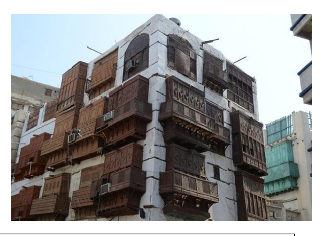
Figure 7,8, Historic buildings in Jeddah, built in Islamic style were wooden decorations and mashrabiyas