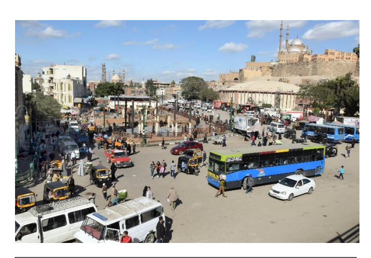
Figure 2, Illustrates the overlap of uses and public transport access to heritage areas, which affects the overall shape of the historic area.