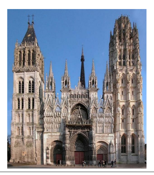
Figure 16, Notre Dame Cathedral in the French region of Rouen, the world's tallest and most famous cathedral

Rouen flourished in the Middle Ages and one of the region's most famous buildings, which still exists today, is The Castle of Rouen, the Museum of Fine Arts (de Rouen), which houses the second largest collection of impressionist works in France, where you can see unique paintings, sculptures, magnificent decorations and other works of art, some of which date back more than 500 years.