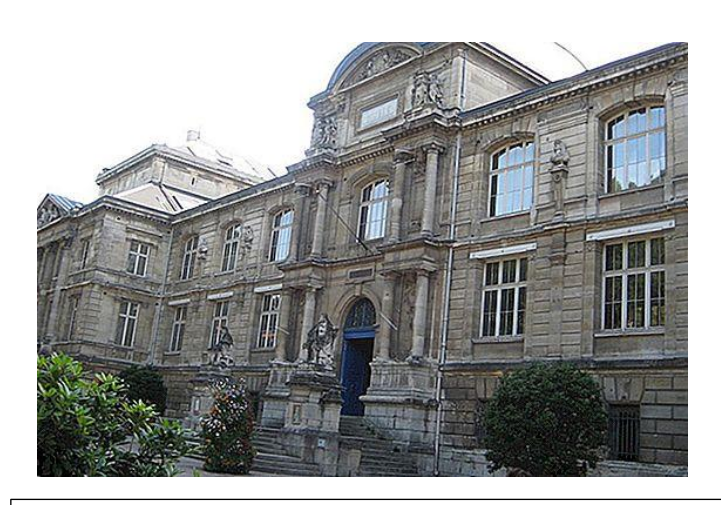
Figure 17, Museum of Fine Arts in the French region of Rouen and is one of the most famous heritage buildings in it