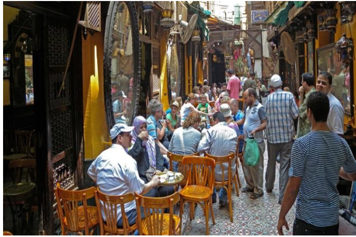
Figure 3, Illustrates the overlap of uses and concerns of walkways within the heritage areas of Khan al-Khalili.