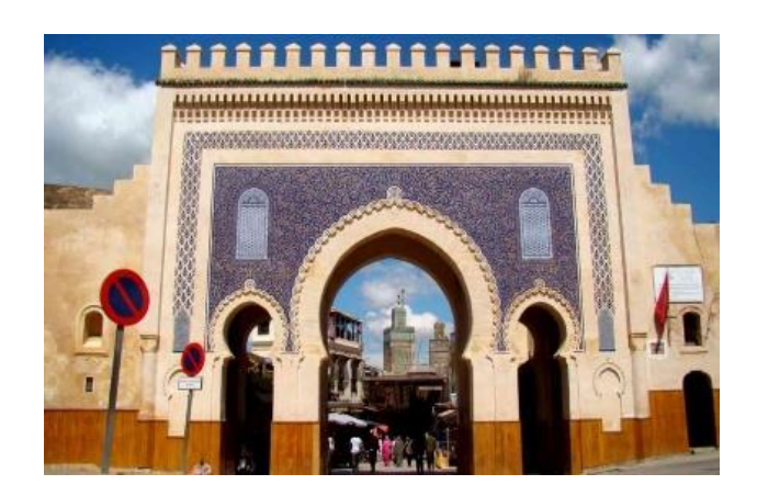
Figure 4,5, The most important landmarks of Fez historical wall of Fez city on the left, and Bab Bugled on the right