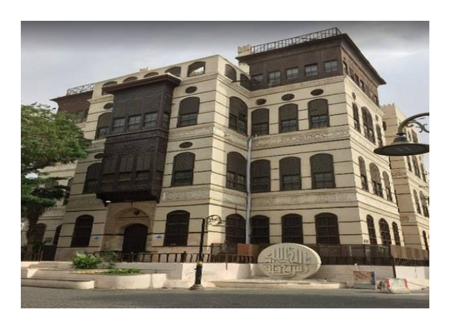
Figure 10, Beit Al Nassif is one of the most famous houses in the historical area of Jeddah