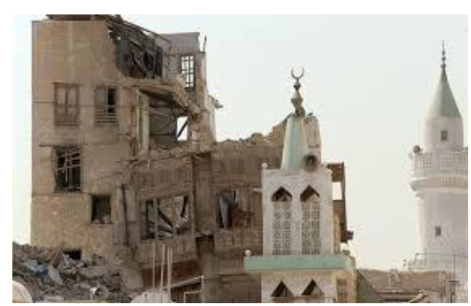
Figure 11,12, Jeddah heritage buildings demolished and vandalized