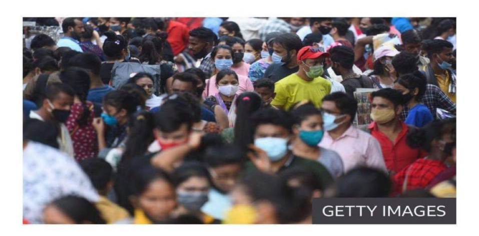
Figure (9): a picture showing a group of people or mass crowd in the news images which did not show Indians' recognizable facial expressions