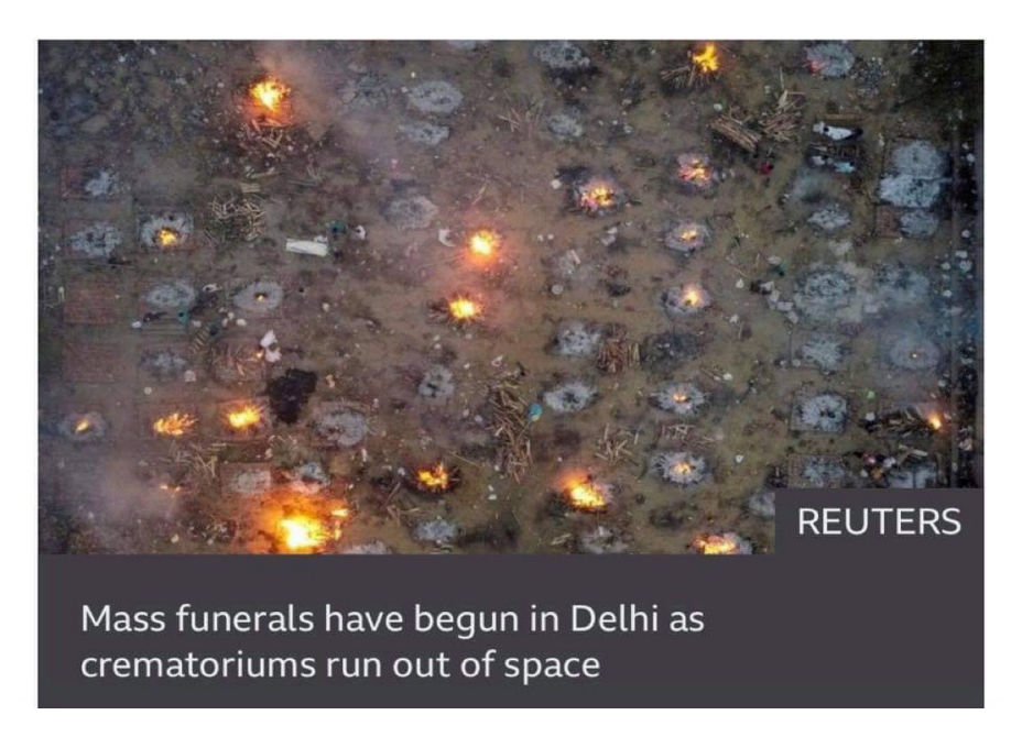
Figure (6): Mass funerals in Delhi