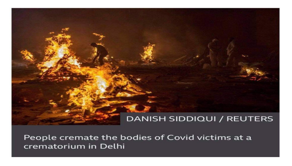
Figure (5): People cremate the bodies of Covid-19 victims in Delhi