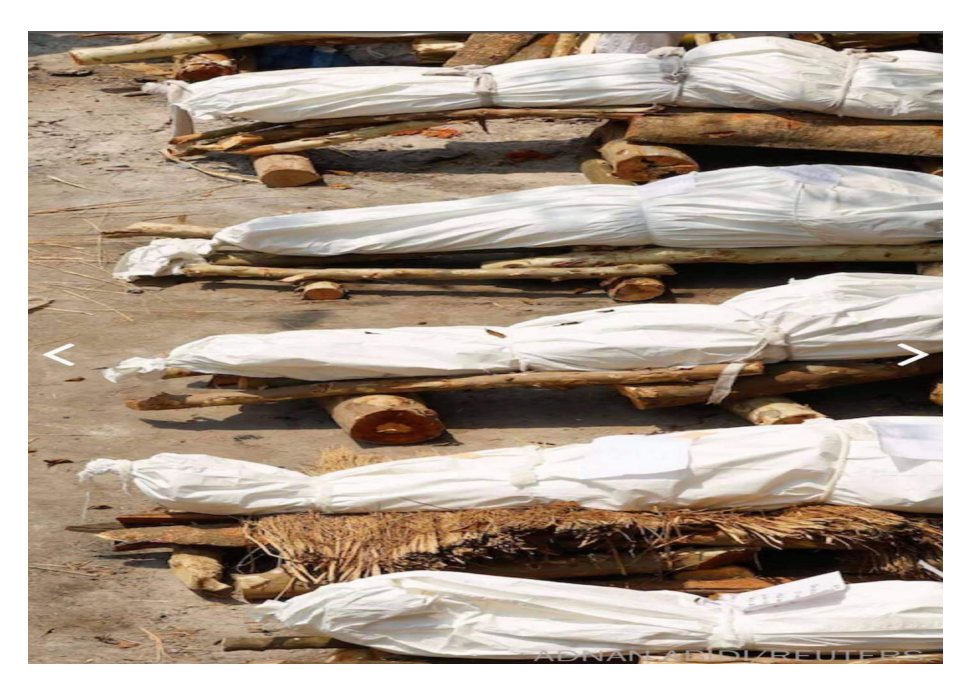
Figure (10): images of corpses (dead bodies)