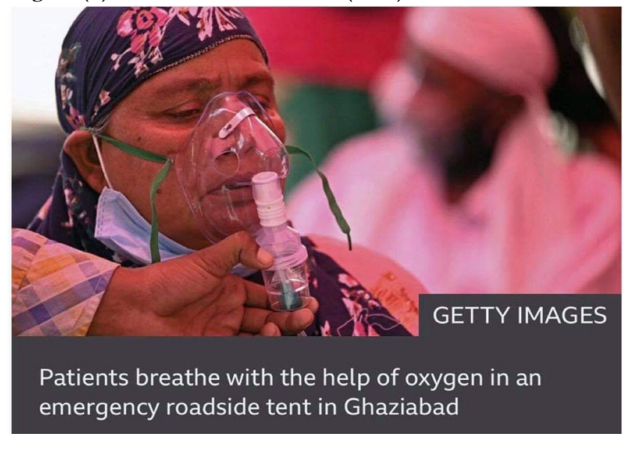
Figure (7): a picture showing how people are suffering and trying to get medical service