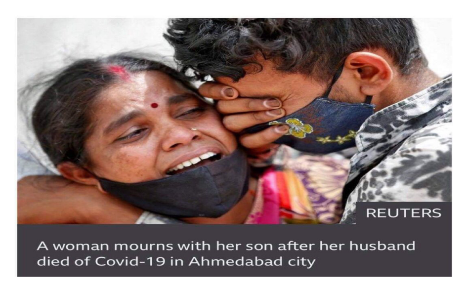
Figure (8): a picture showing the misery and the loss of lives