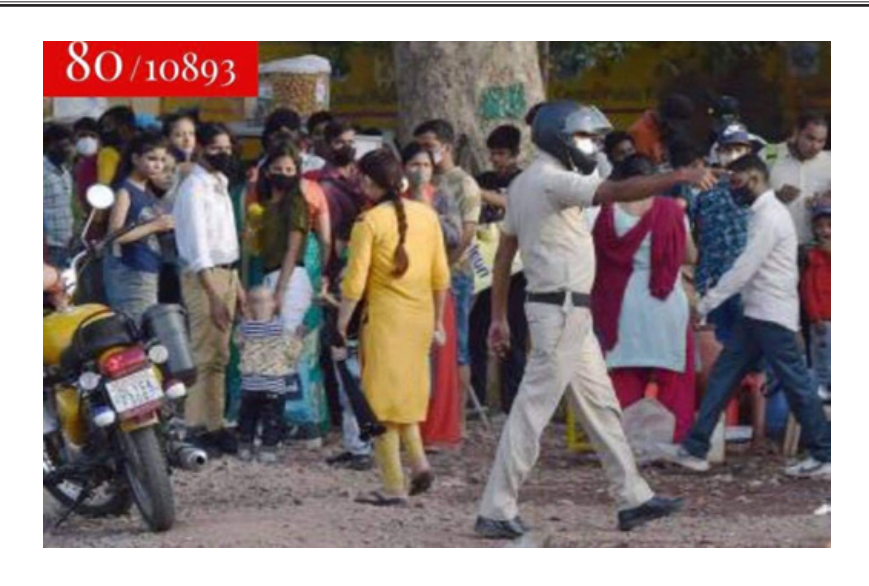
Figure (2): a long-shot portrayal was mostly used to show a large group of bodies or people in crowded areas in a broad story context