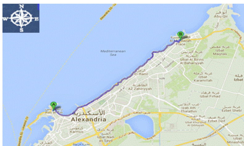
Fig. 1: Map illustrates the study stations (A and B) (from Google earth)

Alexandria is the main harbor on the north coast of Egypt, extending about 32 Km along the coast of the Mediterranean Sea, at latitude 31,118836 ° N and longitude 29,551502°E. The macroalgal samples were collected from two stations namely Ras Al-Tin (A) and Al-Muntazah (B) along 18.6 Km distance, Alexandria coast (Fig. 1).