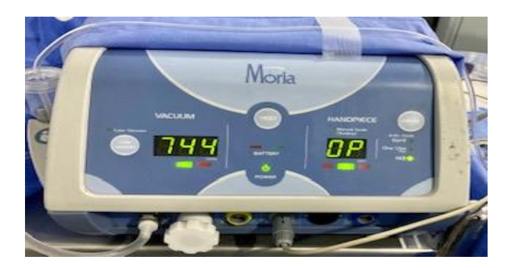
Figure (1): Moria II Microkeratome.

Mean time elapsed between phaco and Lasik surgeries \pm SD was 8.66 \pm 2.11 weeks (Range: 6–24 Weeks).