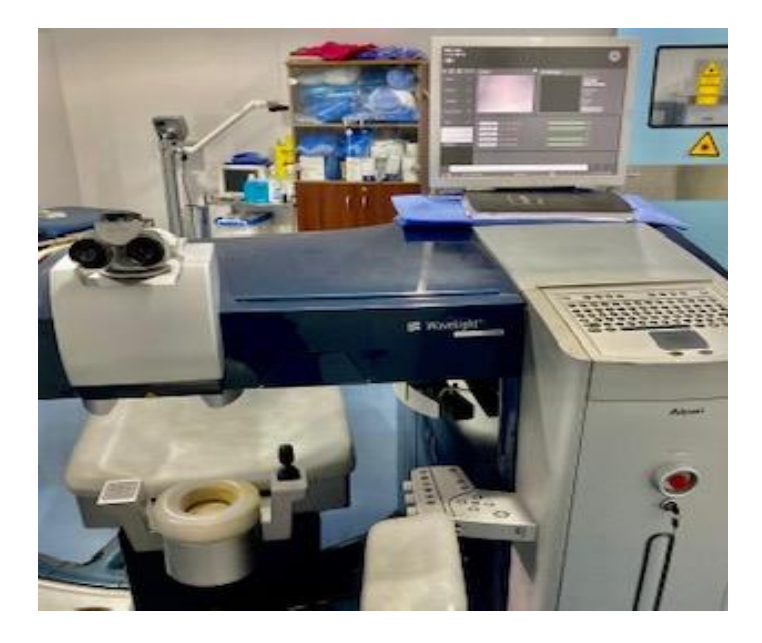
Figure (2): Excimer-Laser WaveLight EX500.