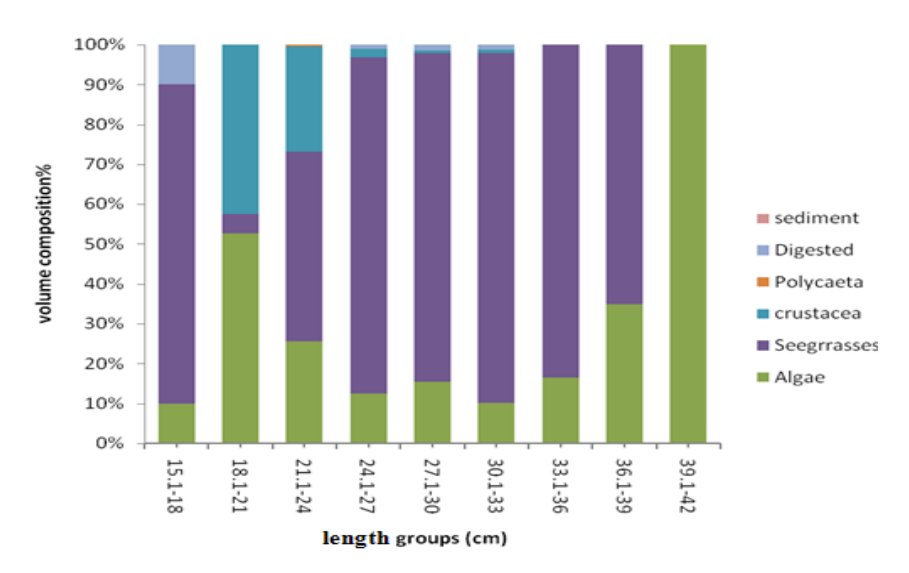
Fig. 2: The diet composition of different length classes of S. Salpa.

Fishes were classified into nine classes from 15.1 to 42 cm with 3 cm interval, the relation between food habits and length of S. salpa is represented in Fig. (2). Algae were found in all length groups and the percentage increased from 10% in small fish (15.1 - 18 cm) by volume composition, reaching their highest level (100%) in biggest fish (39.1 - 42 cm), Sea grasses disappeared in range length (39.1 - 42 cm), however crustaceans disappeared in largest size fish from length group (18.1 - 21 cm), Polychaeta found in range (21.1 - 24 cm) 0.35%, then the digested food were found in small length (15.1 - 18 cm). Thus, the highest rates of food items were sea grasses and algae in most lengths.