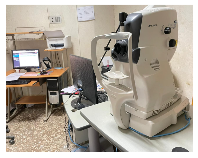
Figure 1: Topcon3D OCT

Optical coherence tomography Spectral domain (SD-OCT) 2000 [Topcon, Inc., Paramus, NJ, USA] was used to assess the state of the retina and macula (Fig. 1).