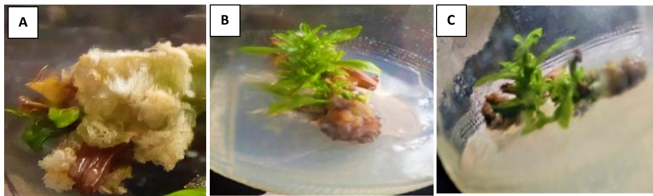
Fig. 2. (A) Induction of callus on explants after 8 weeks from culture on M.S media supplement with (1.0 mg/l PCIB and 0.5 mg/l BA). (B) Effect of PCIB on new-shoot formation in stem explants of Plumbago auriculata produced in vitro . (C) Multiplication on explant after 8 weeks on M.S media supplement with 3 mg/l TIBA.

It is widely established that the auxin: cytokinin ratio is critical for regeneration (Skoog and Miller, 1957). The Plumbago species tendency to rebound, even if there is little or no auxin in the medium (Deshpande et al., 2014). It is possible that the callus has a lot of endogenous auxin activity. In growth regulator experiments with a variety of crop species, PCIB has shown antiauxin action (Frenkel and Haard, 1973; Jacobs and Hertel, 1978; Quattrocchio et al., 1986; Trebitsh and Riov, 1987). As a result, PCIB may aid in the reduction of roots and the enhancement of callus shoot regeneration in some plants.