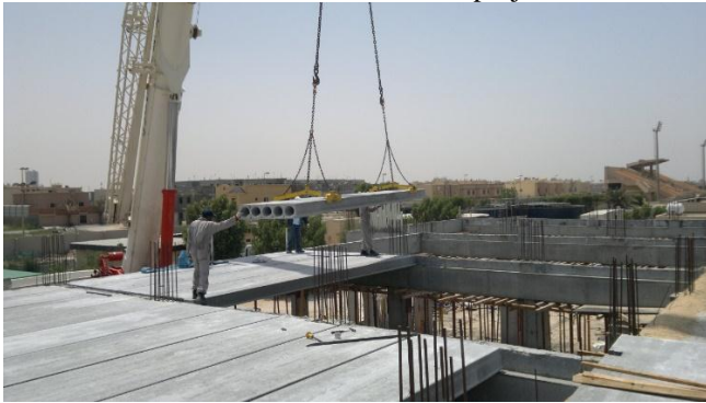
Fig. 2 Onsite installation of the HCS.

Most internal reviews will be performed using digital data which will introduce overhead saving typically associated with paper-based workflow, although the extraction of the shop drawings will still be demanded approval purposes. The project team will not also have access to the laborious production of the as-built documentation at the end of the project.