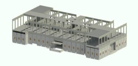
Fig. 1 3D BIM Model and 2D CAD Drawings