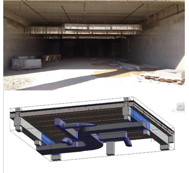
Fig. 3 On-site improper Installation for Air-Conditioning channels

This problem arose or showed up as a consequence of the shortage of visualization and synchronization of the current site layout and communicating break down within the contractor and the subcontractor concerning the design of the HAVC system and also as a result of the owner not holding back the completion of all designs for the project. In particular the design of the HAVC. The HAVC designs were made by the general contractor via a subcontractor which came incompatible with what was applied with the rest of the drawings of the project.