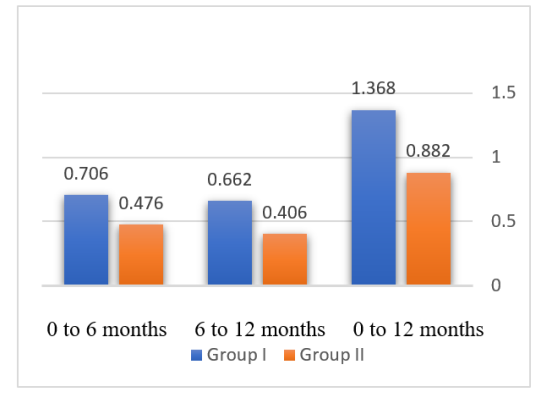
Figure 3 Mean values (mm) of marginal bone loss in studied groups during follow-up period.

Twelve months after implant loading, the mean amount of the detected peri-implant bone loss was (1.368) mm and (0.882) mm for group I and group II, respectively. The difference between the two groups was found to be highly statistically significant p>0.05.