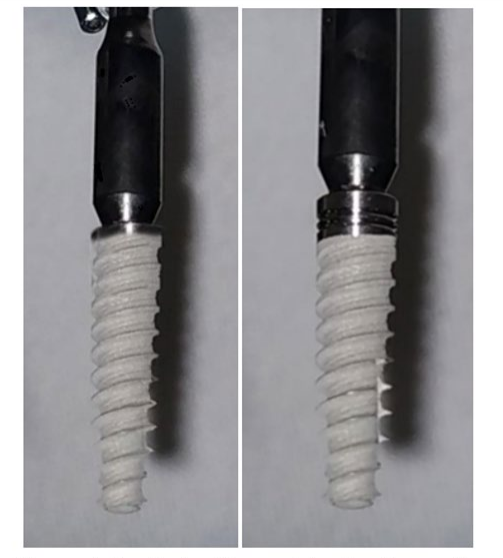
Figure 1 Implant with machined collar on the right and implant with rough collar on the left

Two implants with the same width and height only different in the collar surface texture were selected (V-Plus, V-Hybrid -Vitronex - Italy) (figure 1).