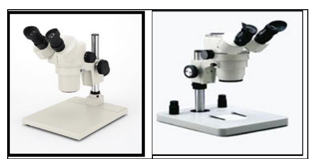
Figure (2): Some microscopes

allows an examiner to view detail not seen with naked eyes or a hand magnifier. This is particularly important in specific examinations to the pressure of writing.