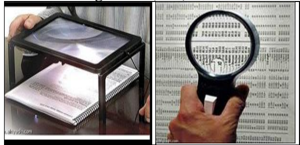
Figure (1): Structure of some magnifiers

Magnifiers depend on the zoom magnifiers (lenses) to identify the shape of strokes. The magnification lenses: simple lenses, lenses double or triple, so there are magnifiers that have different X, where X indicates the amount of zoom or magnification used to examine the tremors.