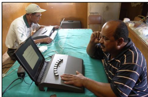
Figure 2. Two of the participants during testing