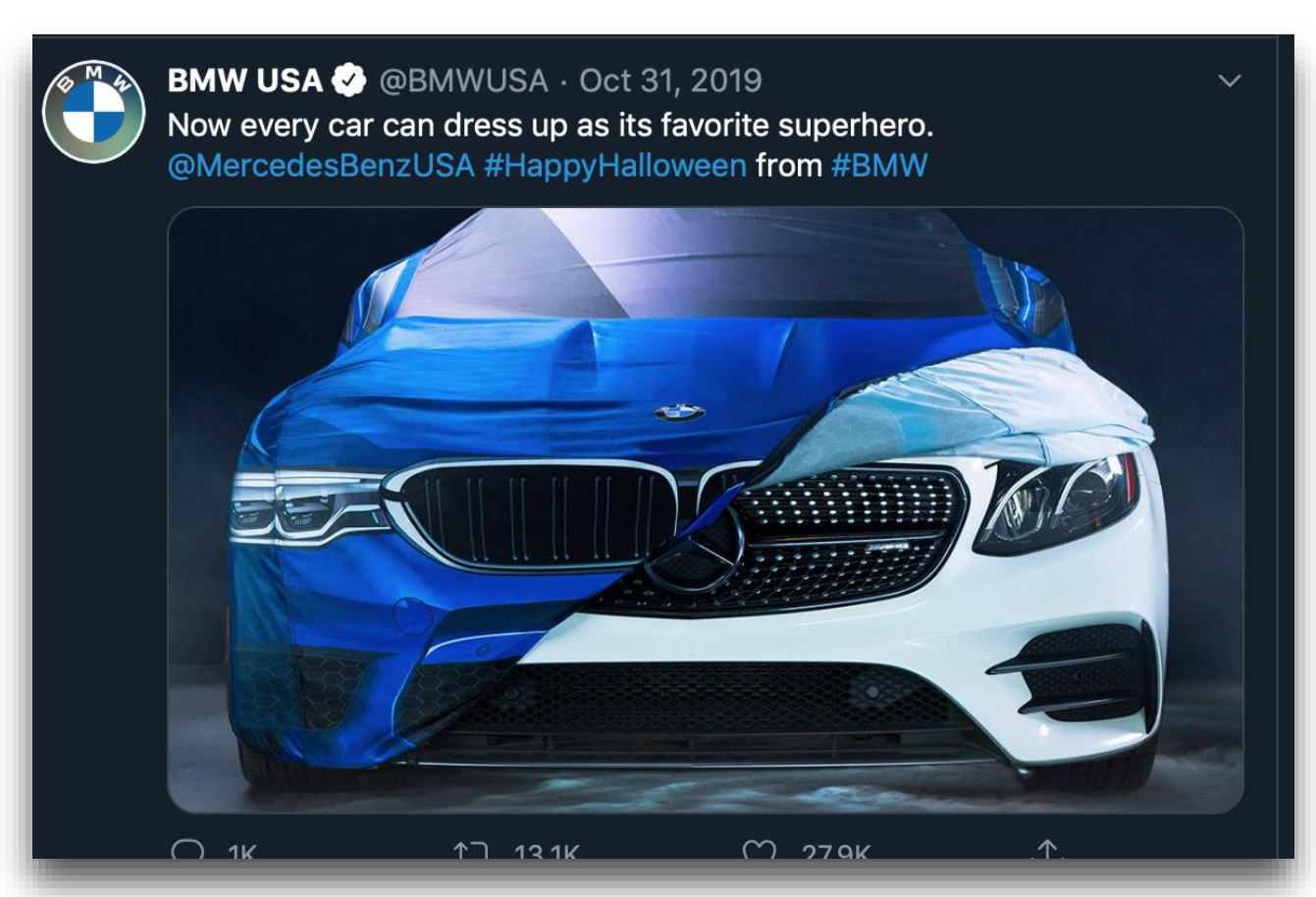
Fig.1 BMW advertisement on Halloween (2019).