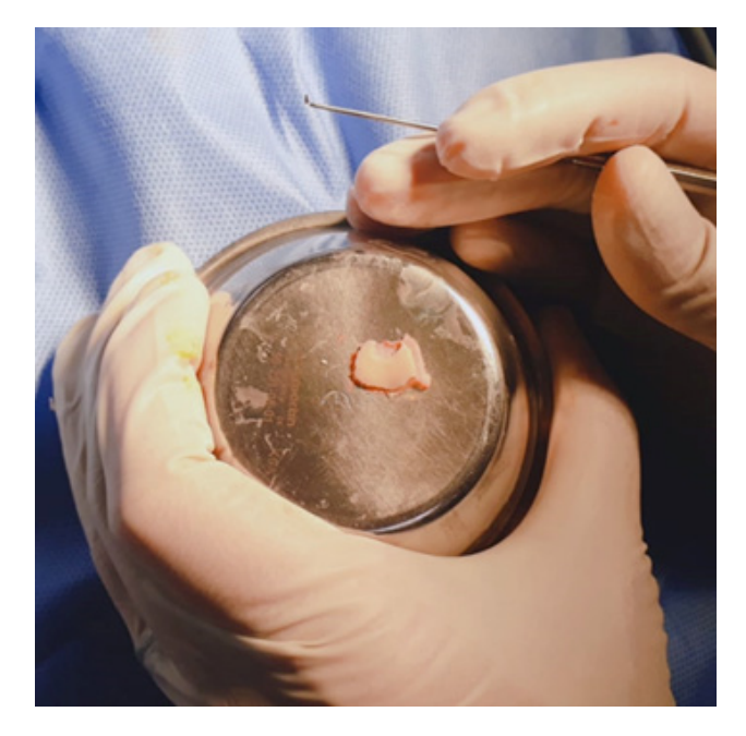
Fig. 3: Harvested composite chondro-perichondrium graft with the removal of a V-shaped wedge of the cartilage.