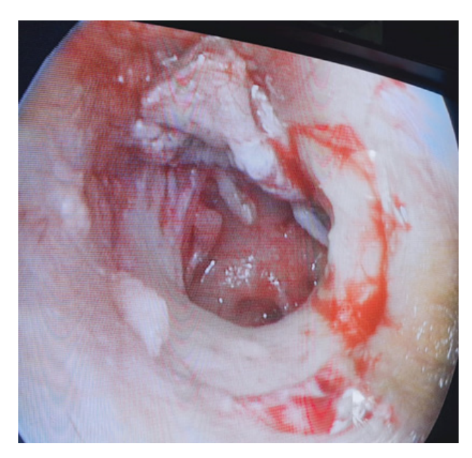
Fig. 2: Endoscopic view showing the ossicles after removal of the drum remnant from the handle of the malleus.