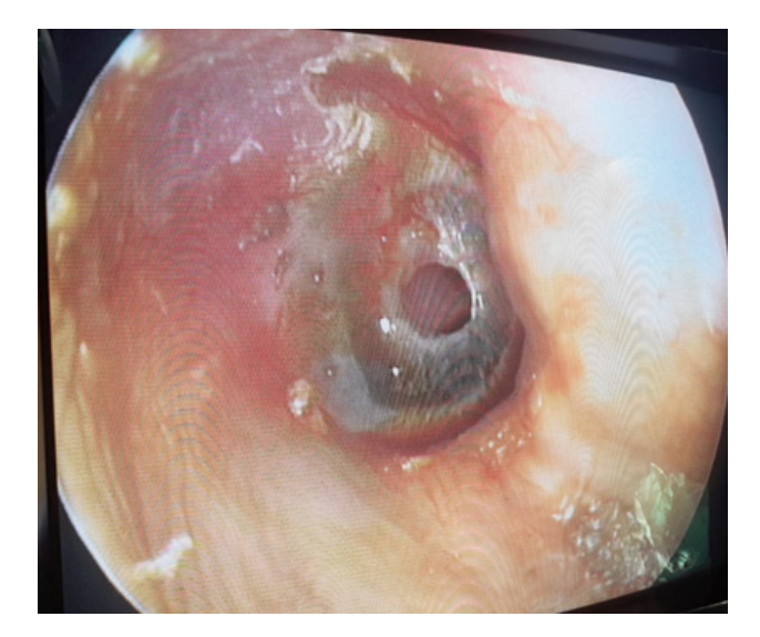
Fig. 1: Endoscopic view showing anterior central perforation after trimming of the edges.

Patients were discharged 1 day after surgery and postoperative pain was analyzed by Wong-Baker FACES pain rating scale at the time of discharge then the patients were called for follow up after 7 days (to remove the suture), one, 3, and 6 months postoperatively and the possible complications such as blunting, lateralization of the tympanic membrane, iatrogenic cholesteatoma and ossicular injury were noted. Pure Tone Audiometry was done again at the three months follow-up visit.