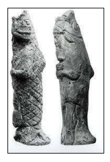
Fig.12 Statue of "apkallu" wearing fish skin - found in the temple of "Ninurta Kalhu" in Iraq - (860-865 BC) - British Museum - London

(https://www.worldhistory.org/image/6225/adda-seal)