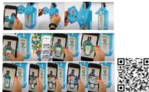
Figure (6) Bombay Sapphire Reinforced Packaging

( https://econsultancy.com/how-shazam-is-using-augmented-reality-to-help-brands-come-to-life-22/4/2021-10.31PM )