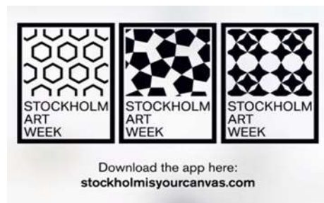
Figure (3) shows the design of the exhibition posters