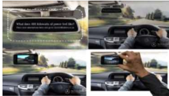
Figure (13) An interactive advertisement for Mercedes that enables the viewer to experience the virtual product

The interactive print advertisement using modern digital technologies was able to overcome most of the difficulties that were facing the traditional advertising communication, so it became a two-way communication between the advertiser and the consumer. And raise the level of their association with advertising.