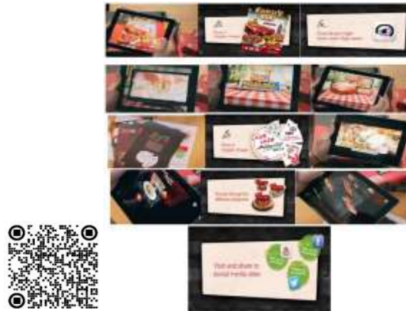
Figure (11) Augmented Pizzahut brochure