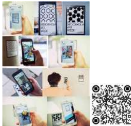
Figure (2) An illustration of the use of the promotional poster for the art exhibition

Swedish agency M&C Saatchi brought this campaign for Art Week in “the Stockholm ART WEEK” to bring the city's art scene to life with an augmented reality application that allowed everyone to submit their work and display it in posters and the official catalog. Users only had to scan the designed codes on the poster to see the surprising artwork on their phones, they relied on designing the posters on QR code with different designs and shapes without placing any special images on the exhibition board in order to make the recipient more interactive and effects. ( https://catchoom.com/blog/16-cool-augmented-reality-advertising-22/3/2021-05:22AM )