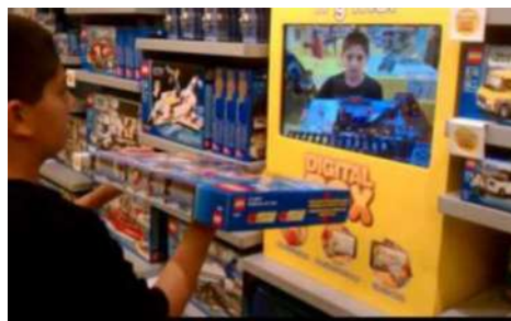
Figure (5) The Lego packaging

AR technology offers other ways for marketers and advertisers to increase sales. Consumers can try out various products from shoes, clothes, jewelry, watches, games, etc. This makes AR advertising a powerful tool for driving sales and increasing revenue. We find that Lego has used augmented reality in its stores, and has developed a device that if children point toy boxes at it, the final toy designs will appear on the screen as 3D models.