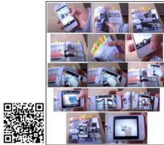
Figure (12) Augmented IKEA Catalog