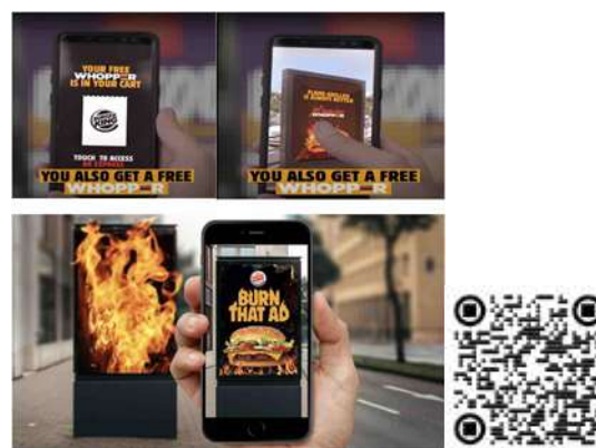
Figure (4) shows a Burger King advertisement. When you click on the label, it shows special offers for the product

( https://prsmith.org/2019/03/28/how-can-ar-turn-a-competitors-ads(10-4-2021-11:47PM) )