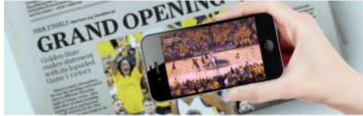
Figure (10) augmented Ledger Dispatch

In a dramatic move that promises to boost newspaper revenue while delighting its readers, a Northern California newspaper is using augmented reality technology to bring its newspaper to life. , Snapshots of editorial topics covered by videos on smartphone screens. Converting the press topic from a two-dimensional static topic on the left to an interactive three-dimensional topic The Interactive News Initiative allows readers to use their smartphones to view images in newspapers and access a deeper level of content. After downloading an app, readers simply hold their Android or iPhone devices over images or blocks of text to begin the interactive experience. With this tool, readers can use their newspaper as a launching pad for watching movie trailers, shopping for a new car, or exploring different dimensions, Ledger Dispatch publisher Jack Mitchell said. On everyone's smartphone, it turns the newspaper into a portal to access unlimited opportunities in the reader's community and beyond."