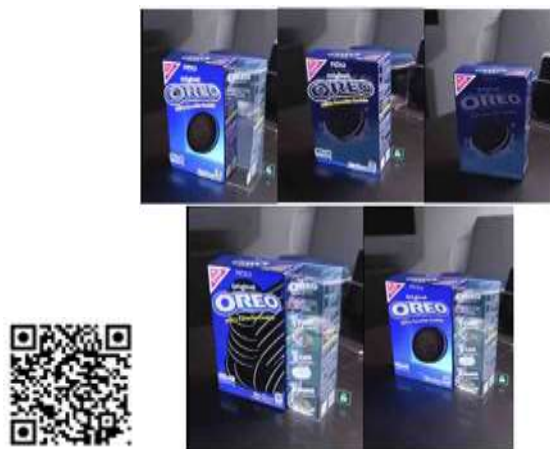
Figure (7) OREO augmented Packaging

https://visualise.com/case-study/oreo-ar-box-dem-22/4/2021-1.15AM )