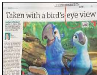
Figure (8) illustrates the augmented reality sign in newspapers

Augmented reality is an interesting newspaper feature that takes readers beyond the printed page. It enables people to watch a video, animation, or other seemingly unexpected content on a page of their newspaper. A virtual environment is created when the augmented reality software and the camera software of a smartphone or tablet work together. The newspaper must be viewed through the camera of the mobile device, in addition, the device must be connected to the Internet.