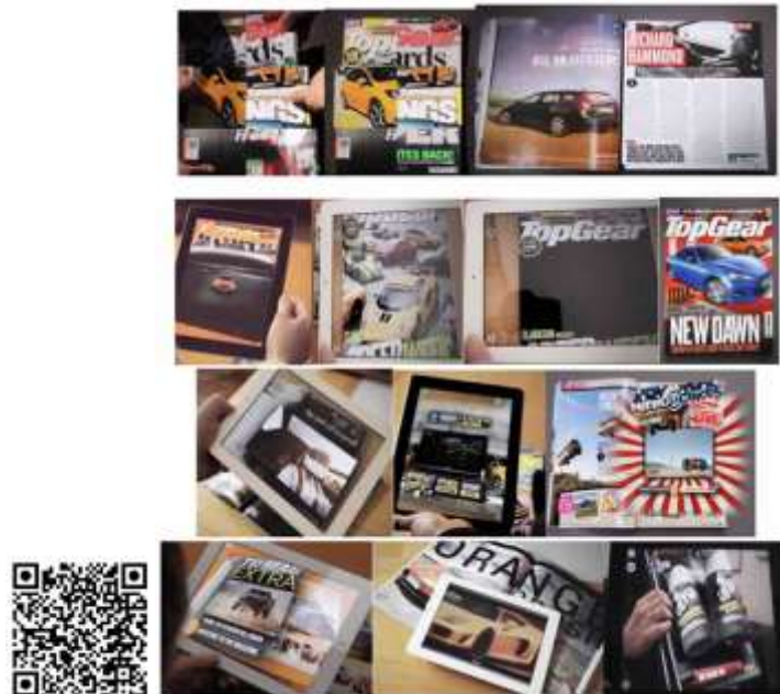
Figure (9) An advertisement for an augmented in the "Top Gear Mag" magazine.

The December 2011 release of “Top Gear Mag “combined print and video with attractive covers and vibrant content using augmented reality technology. Besides winning awards, they have published over 8 issues with 50,000 to 100,000 views per issue, an engagement rate of 27%, and a click-through rate of 25%. World, using the expertise of motion graphics designers to create smooth, engaging covers and editorial content that comes to life through the magic of augmented reality. The magazine, which has a monthly readership of 1.8 million people, has seen an increase in video views as a result of simulation and interaction.