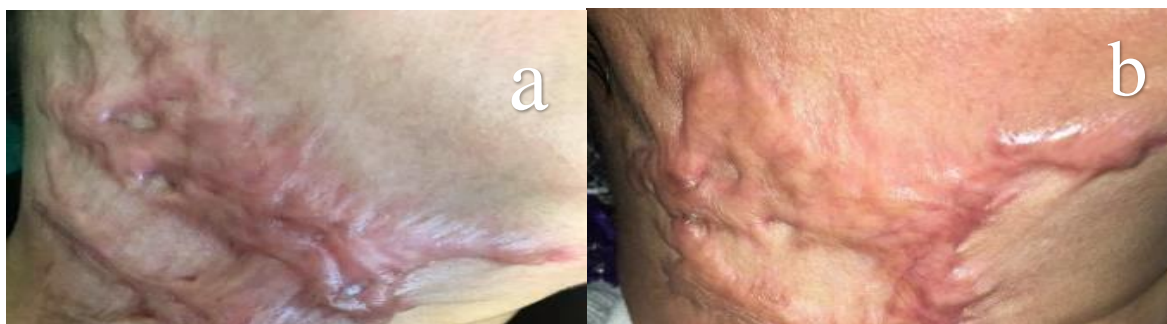
Fig. 2: before (a) and 1 month after (b) treatment with MTX for 6 sessions.