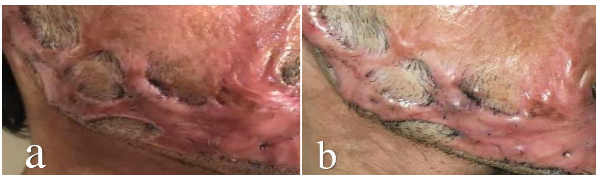
Fig. 3: before (a) and 1 month after (b) treatment with Verapamil for 6 session