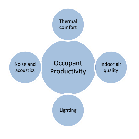
Fig.10 IEQ factors affected by glazing on Occupant Productivity

One east-facing classroom and one west-facing one is examined. With the assistance of the DIALux Evo 6.0,