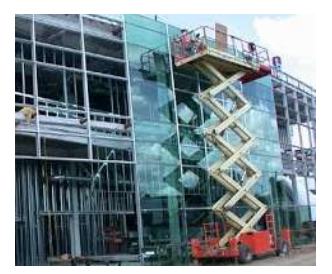
Fig.2 Stick system

It is the earliest form of curtain wall technology in which vertical extrusion span between floor plates (fig.2). It is much of the fabrication and assembly work that occurs on-site where the quality control and general conditions are more challenging. The system is appropriate for geographic regions with cheap site labor.