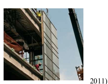
Fig.4 Unitized System (Patterson,

The unitized system (fig.4) has largely replaced stick technology in large commercial applications. The units are assembled in the factory and shipped to the field as it shifts more labor to factory-controlled conditions. Additionally, it is better quality and quality control from factory assembly and, thus, may reduce expensive site labor.