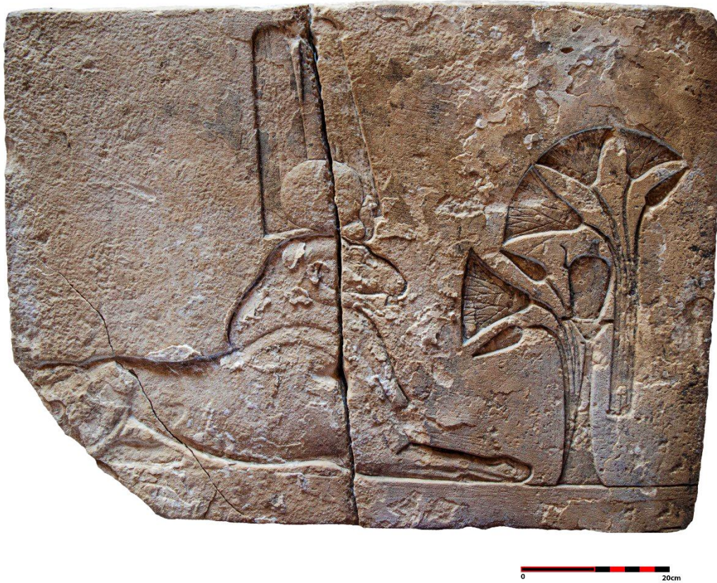
[FIGURE 1]: Amun-Ra stela