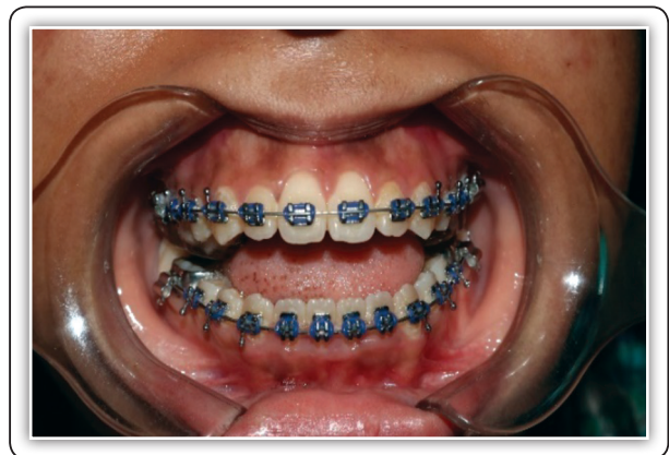
FIG (2): TPA with 4 mm acrylic posterior bite plane.