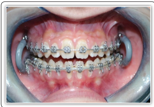
FIG (1): RMI with fixed appliance.

TPA with 3 to 4 mm 6-12 beyond the resting position to maintain pressure on the neuromuscular system supporting the mandible. acrylic posterior bite plane was delivered and the patients was trained to bite on it (Fig 2).